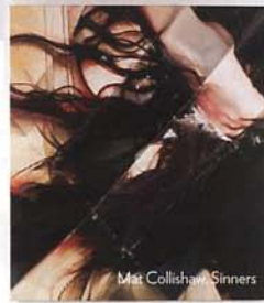
Mat Collishaw Sinners