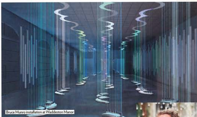
Bruce Munro installation at Waddesdon Manor