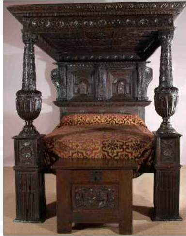
Elizabethan Tester Bed Godolphin House from Beedham Antiques