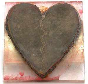
Broken Heart – wood, rubber & Perspex print block 140mm x 140mm