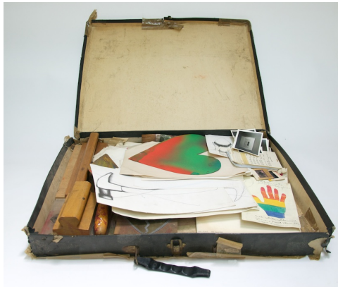
Complete Archive in its portfolio 590mm x 480mm