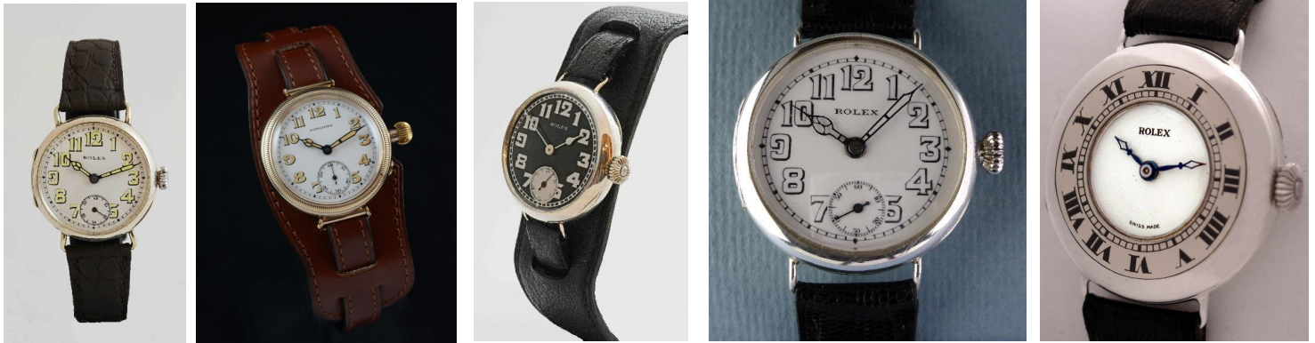
From left: Rolex WW1 Officers Trench watch, 1916, Longines, 1922 and Rolex Officers Trench watch, 1916 from Anthony Green; Rolex Officers Trench watch, 1916 and Rolex Half Hunter Officers Trench watch, 1917 from Kleanthous Antiques

The rise of the modern wristwatch from the trenches of World War I