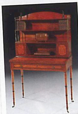
FINE GEORGE III HEPPLEWHITE PERIOD SATINWOOD VENEERED BONHEUR DU JOUR FROM FRESHFORDS FINE ANTIQUES