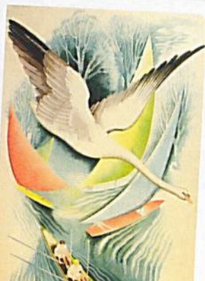
REGENT'S PARK BAKER STREET STATION for Clarence Gate LONDON UNDERGROUND, REGENT'S PARK BY FRANK ORRHOOD 1937 VINTAGE LONDON UNDERGROUND POSTER FROM ANTIKBAR