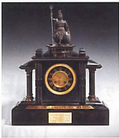
A ROYAL PRESENTATION CLOCK COMMISSIONED BY HRH ALBERT EDWARD, PRINCE OF WALES FROM ASPREY'S OF BOND STREET FROM WICK ANTIQUES

trusted resource for private collectors and the art & antiques trader in the UK and 16 other countries around the world.