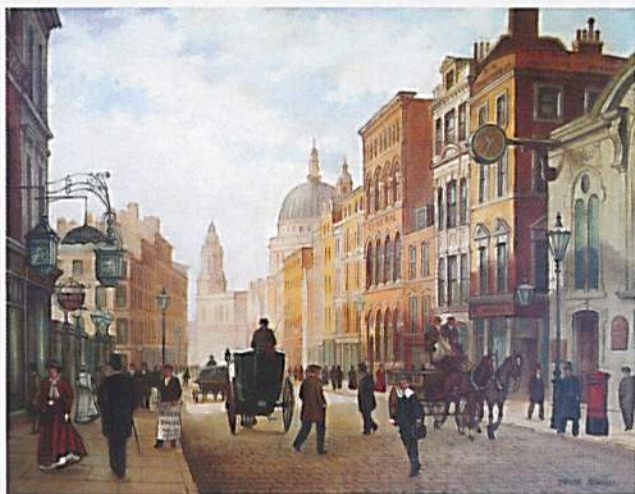
ST. PAUL'S CATHEDRAL IN 1900 BY STEVEN SCHOLES OIL ON CANVAS FROM ASHLEIGH HOUSE FINE ART