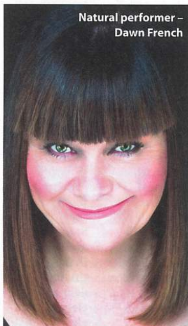
Natural performer - Dawn French

◆ On tour until 6 December: 0844-875 8758, www.dawnfrenchontour.com