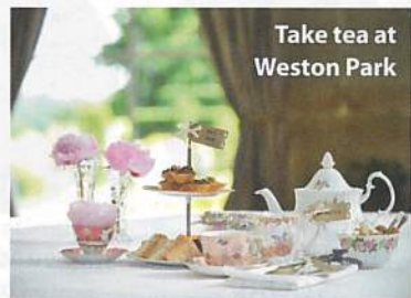
Take tea at Weston Park

CAMBRIDGE FILM FESTIVAL One of the UK's longest-running film festivals. Expect outdoor screenings, silent films, Q&A sessions and more. From 28 August to 7 September, in venues around Cambridge: 01223-500082, www.cambridgefilmfestival.org.uk